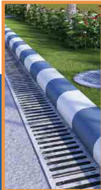
Sky Drop Harvesting