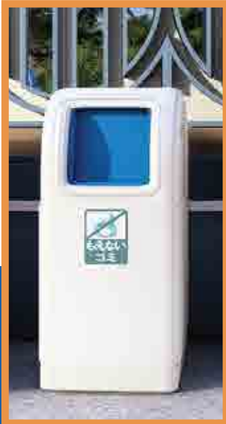
Waste Control Hub