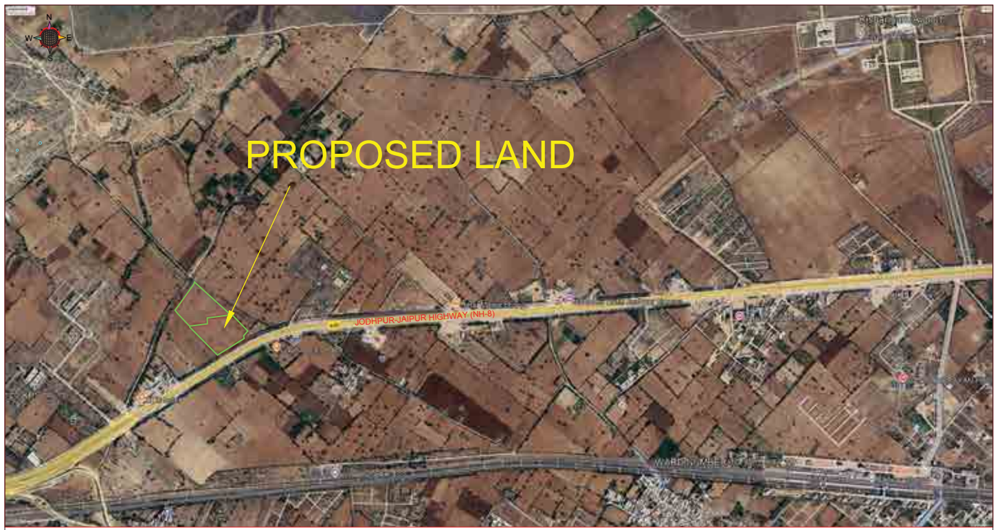
Satellite Google Map