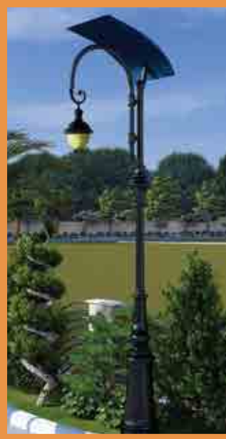
Jet Light Poles