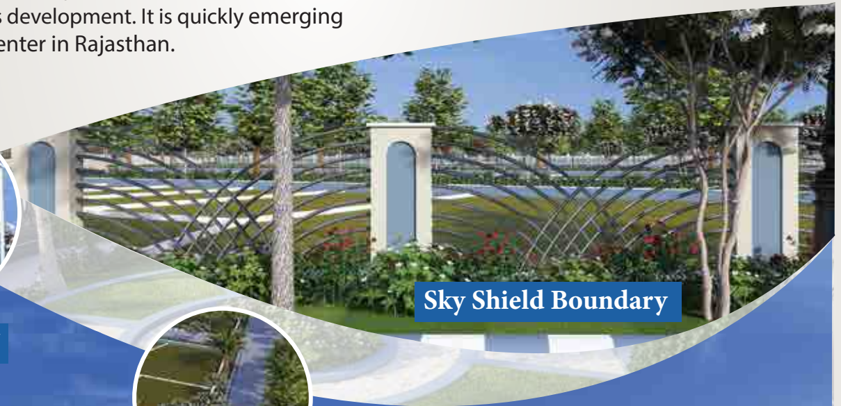
Sky Shield Boundary