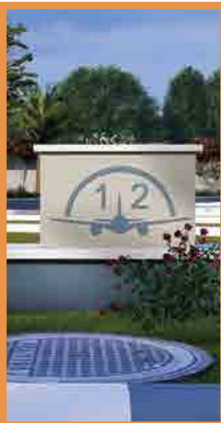
Wing Span Boundary