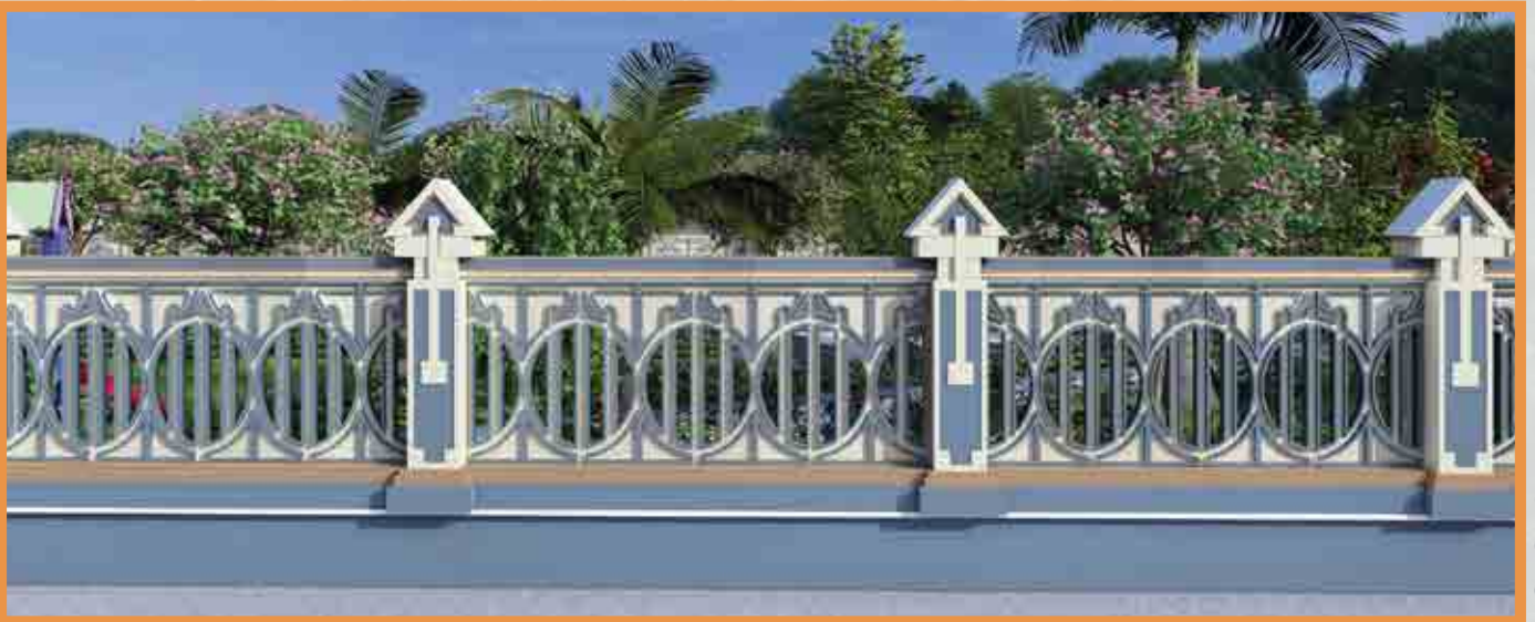
Aero Shield Wall