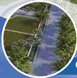
CC Road Runway